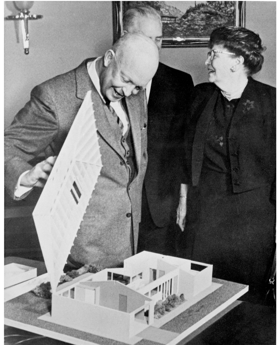
January 1961: At the first-ever White House Conference on Aging, AARP founder Dr. Ethel Percy Andrus shows President Dwight D. Eisenhower a model of the "Freedom House," a home designed and built by AARP using "universal design" features so older adults can "age-in-place."